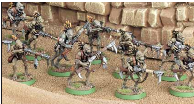
Mercenary Kroot advance through a rocky valley.

Fieldcraft: Kroot are naturally adept in arboreal environments and gain +1 to their cover save in woods or jungles. Kroot in woods or jungles do not have to make a difficult terrain test, they can always make a normal move. If they do not move in the Movement phase, they may see and shoot through 12" of woods or jungle terrain rather than the 6" that would normally be the case.